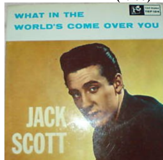
EP TEP 124 (1960)