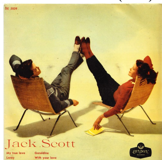
EP RE 5039 (1959)