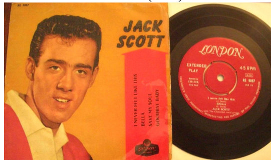
EP RE 5057(1959)