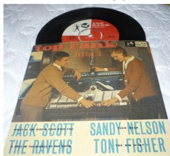
EP COMPILATION TEP 121 (1960)